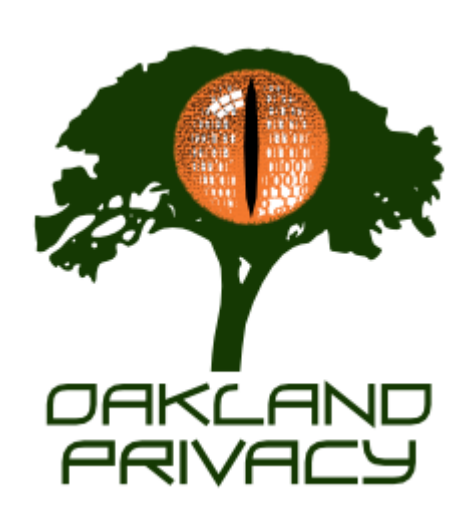
I've been watching you watching me...

If you are interested in joining the Oakland Privacy email listsery, contact us: contact@oaklandprivacy.org or send email to: oaklandprivacyworkinggroup-subscribe@lists.riseup.net (OVER)