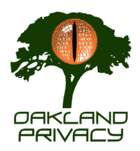
I've been watching you watching me...

Join Oakland Privacy to organize against the surveillance state, against Urban Shield, and to advocate for privacy and surveillance regulation ordinances to be passed around the Bay Area (see back).