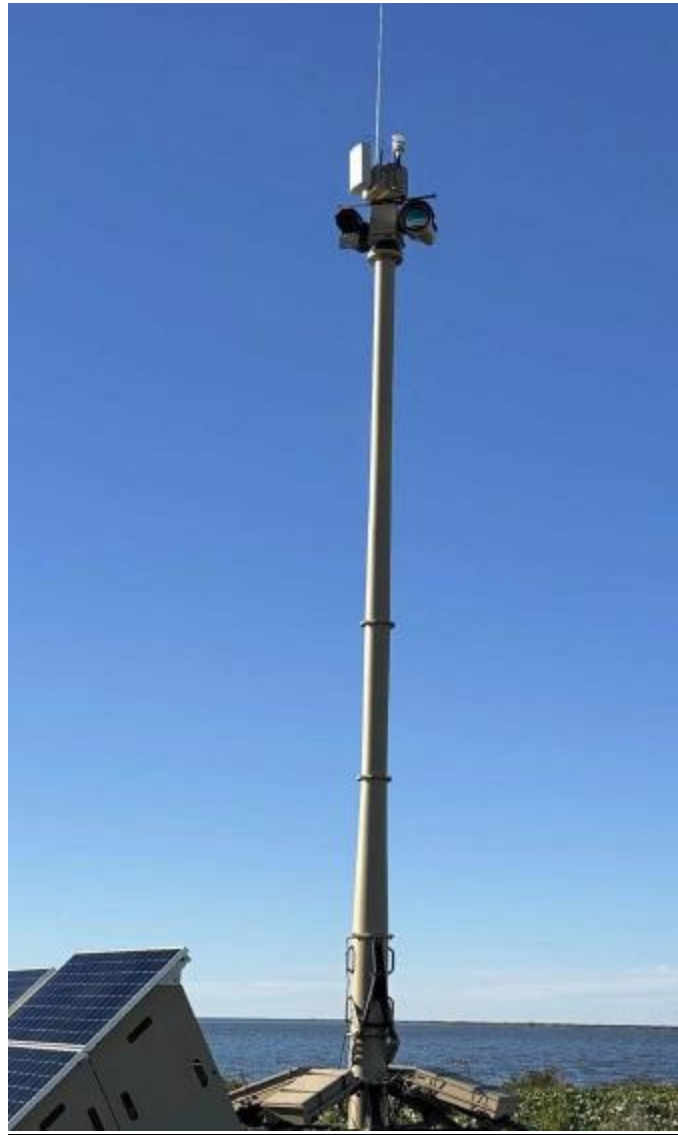
Figure 2 – Portable Tower System